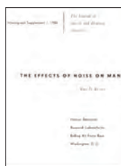
Figure 1. The Effects of Noise on Man .

For historical perspective, here is a brief look back at some of the key landmark publications and regulations pertaining to “safe listening” and hearing preservation. Authors’ note: The origins of noise standards have a long and complicated history, and due to space restrictions are greatly simplified here (eg, see Franks 6 and Goldsmith 4 ).