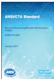
Figure 9. ANSI/CTA standard 2051 for personal sound amplification.

This alarming report initiated the ITU standard on personal amplifiers. In 2017, the Consumer Technology Association (CTA) published the ANSI/CTA standard 2051 on “Personal Sound Amplification Performance Criteria” 16 (Figure 9). The safety aspects in this standard state that “The maximum OSPL90 output level shall not exceed 120 dB SPL measured in a 2cc coupler.” This standard exceeds the safety level set by IEC 62368-1 (ie, the LAeq,T to be lower or equal to the sound output value of 100 dBA) by more than 15 dB if we correct 5 dB for the conversion dB SPL to dBA.