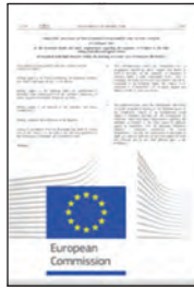
Figure 5. The EU Noise at Work regulations.