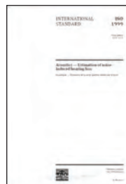
Figure 2. ISO 1999-2013.

1971: Just after the passage of the US Occupational Safety and Health Act of 1970 —which created the Occupational Safety and Health Administration (OSHA) and the National Institute for Occupational Safety and Health (NIOSH)—the first International Standards Organization (ISO) publication on occupational noise is published (ISO 1999 “Acoustics—Assessment of occupational noise exposure for hearing conservation purposes”). This standard has been reviewed many times, with the latest version issued in 2018 and maintained as ISO 1999-2013 “Acoustics—Estimation of noise-induced hearing loss” (Figure 2). 9 Noise exposure level over time is the main criterium used in this standard, and