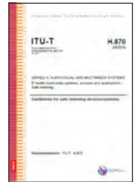
Figure 7. ITU-T/WHO H.870 safe-listening guidelines for A/V and multimedia systems.

In 2018, IEC 62368-1 was reviewed and the concept was introduced that weekly sound dose should be limited to the equivalent of 80 dBA for 40 hours/week as a standard safety level added to the Audio/video (Part 1) safety requirements.