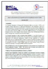
Figure 8. EFHOH and AEA paper on potential risk of using PSAPs.

In December 2015, the European Federation of Hard of Hearing People (EFHOH) and the European Association of Hearing Aid Professionals (AEA) published their “Paper on the potential risk of using ‘Personal Sound Amplification Products’ PSAPs” 15 in which 27 personal sound amplifiers (PSA) commercially available in Europe during 2014 were analyzed (Figure 8). All 27 devices had a maximum output level of more than 120 dB SPL; 23 had an output level exceeding 125 dB SPL, and 8 exceeded 130 dB SPL. None of the products had a limiter of the maximum power. Furthermore, it is very difficult for the end user to understand the difference between a “hearing aid” (designed for the medical purpose of compensating for a hearing loss) and PSAP (a sound amplifier), with the latter shown to provide very high and dangerous sound levels. Both EFHOH and AEA called on all relevant stakeholders to ensure that PSAPs are not used when they exceed unsafe sound levels.