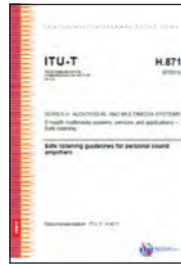
Figure 10. ITU-T/WHO H.871 safe-listening guidelines.

For PSAs with the capacity to measure weekly dose, it is required that weekly maximum sound dose needs to be less than 80 dBA for 40 hours. For example, at 89 dBA, the exposure time is limited to 5 hours/week. For other exposure levels, a linear interpolation and extrapolation applies. According to ITU-T H.870 and H.871, measurements taken of the dynamic range of sound should be accounted for and the reasonably foreseeable use of the products. When PSAs do not have the capacity to measure weekly sound dose, the maximum output of the device needs to be permanently limited to 95 dBA; a user then is unlikely to use the device at a level higher than 80 dBA since the dynamic range of speech has a crest factor of