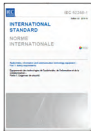
Figure 6. ITC standard for audio/video, information, and communication technology equipment.

In 2010, the International Technical Commission (ITC) published the first standard, IEC 62368-1, for personal audio systems: "Audio/Video, Information and Communication Technology Equipment Part 1: Safety Requirements" (Figure 6). This focuses